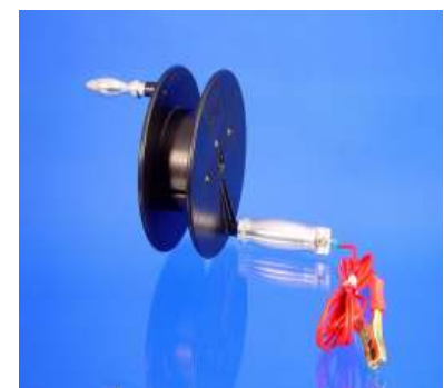
Ex Hand Reel - complete with earthing leads