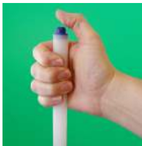
Hold the Blue end - place thumb over hole to prevent the sample from running out