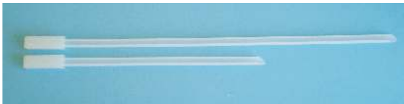
The Powder Lance is available in two convenient lengths