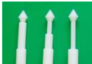
PowderThiefs are available with different tip sizes up to 20ml. 1ml, 5ml and 10ml Tips are shown in the photograph