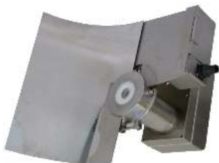
Cross section through a FBD bowl showing the PharmaView