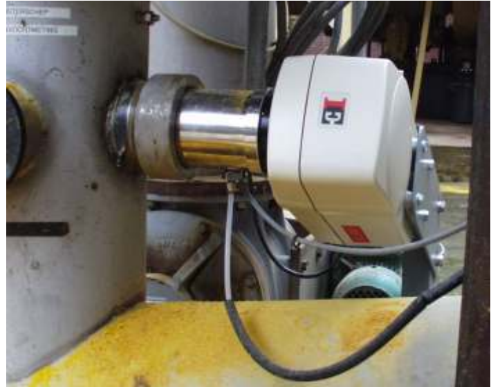
PharmaView installed in a vertical pipeline

The PowderView has been designed to measure moisture in pipelines. Its real time results give it excellent advantages over conventional moisture reading systems.